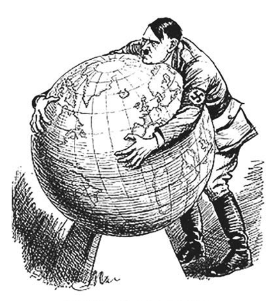
"GERMANY SHALL NEVER BE ENCIRCLED."

[A cartoon showing Hitler's aims in foreign affairs entitled Germany shall never be encircled . It was published in the satirical magazine Punch in April 1939]