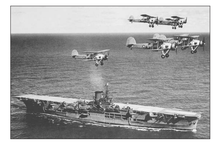
[Mid-20<sup>th</sup> century naval warfare]

Use Sources A, B and C to identify one similarity and one difference in developments in naval warfare over time. [4]