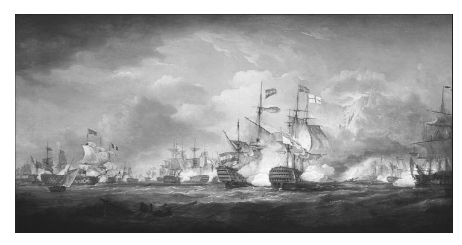
[19<sup>th</sup> century naval warfare]